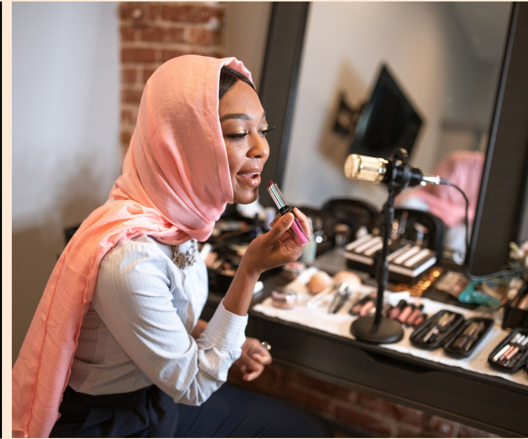
Photo collage of those must-haves

To create a stunning presentation, it's best to simplify your thoughts. Start with an outline of topics and identify highlights, which can be applied to whatever subject you plan on discussing.